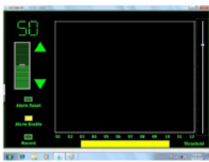
Digital Real Time Display