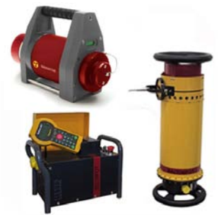
Radiography & More

DON'T MISS NDT BEYOND COMPLIANCE 17-19 OCTOBER 2010