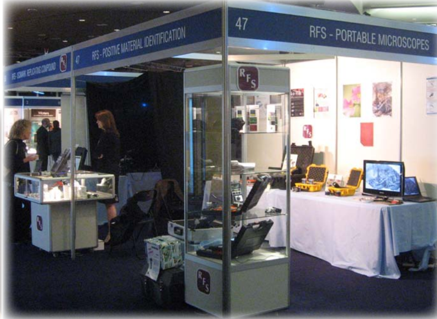
Our Exhibition Booths at ANZFSS